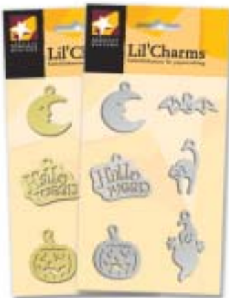
Holiday charms from American Traditional are great for papercrafting and more. Reader Service No. 465

13. Pre-Halloween Crop. Help your scrapbooking customers get their pages all set up for those costume photos by creating their pages in advance. Or invite customers to come in to have their costume photos taken in your store; then they return later to pick up the pics and crop them. ♦