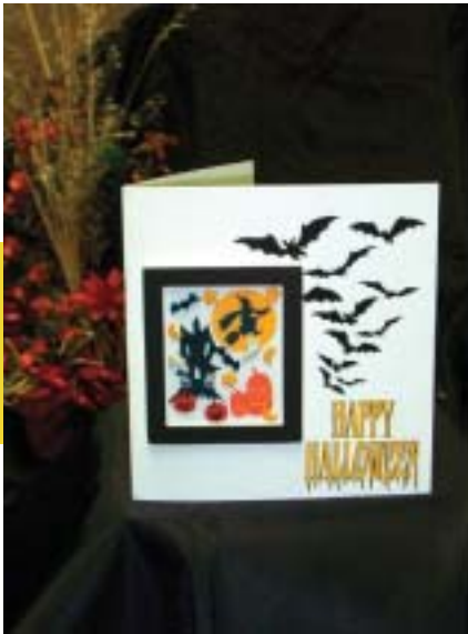
Don't forget about Halloween Candlemaking. This one is courtesy of Dimensional Scrapbooking. Reader Service No. 462

Create etched glass treat jars with handmade templates. Photo courtesy of Armour. Reader Service No. 463