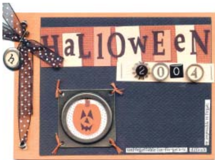
Host a pre-Halloween crop to get a mini album ready before the big event. Project and products by Lil Davis Designs. Reader Service No. 461

Don't be scared by this popular decorating and party holiday. Be prepared with some tricks and treats of your own.