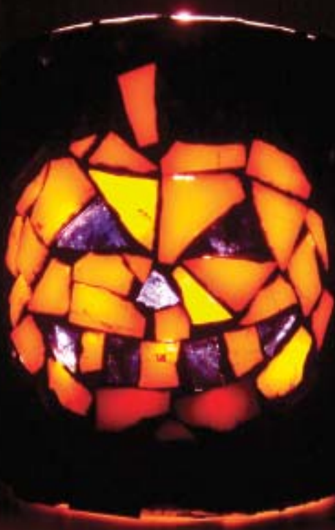
Make a mosaic jack-o-lantern votive with products and instructions from Mosaic Merchants. Reader Service No. 460

Don't be scared by this popular decorating and party holiday. Be prepared with some tricks and treats of your own.